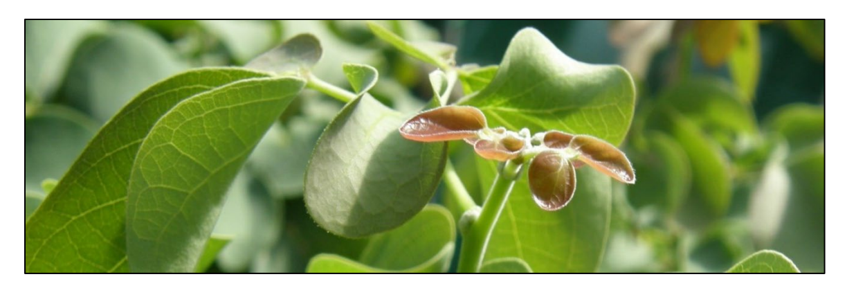
Ka Palupalu o Kanaloa Partnership Project - Kanaloa kahoolawensis