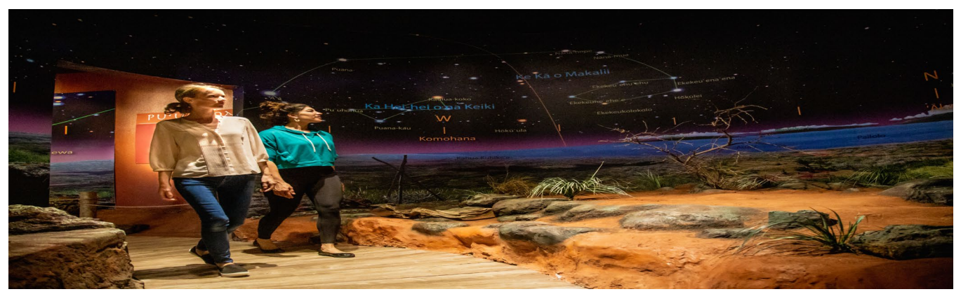
Sharing the Stories of Kaho'olawe's Past, Present and Future (HTA)