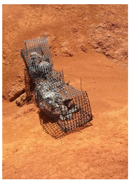
Gabion capturing sediment after a rain event