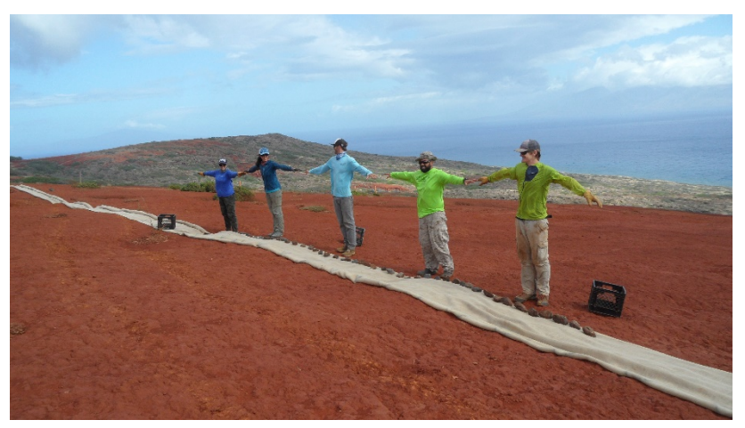
Volunteers rolling up a wattle with burlap fabric and rocks