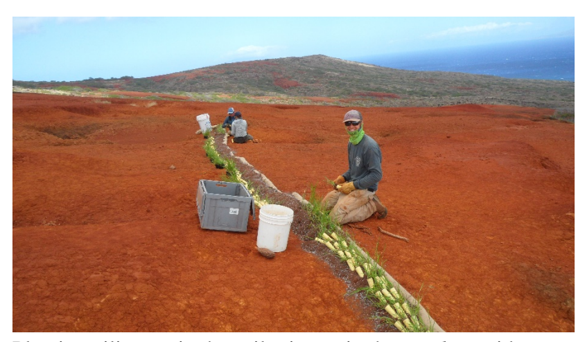
Planting pili grass in the soil mixture in the wattle corridor