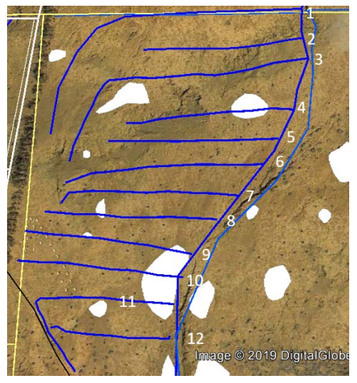
Map of Irrigation Lines (blue) in Zone A of the 25A Project Site