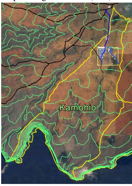
Area of Dryland Forest Project Site in Kamōhio Watershed on Kahoʻolawe