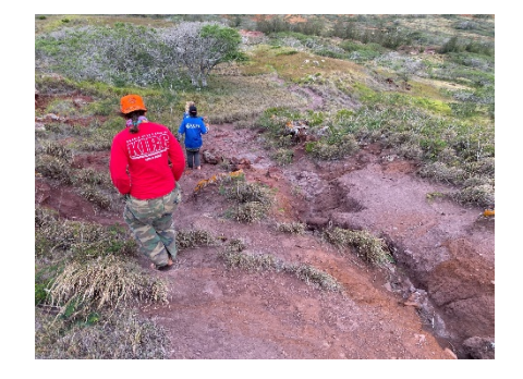
Figure 4. KIRC PIS and KUPU Interns coming down from Pu'u 'O Moa'ula Iki.

In addition to the standard outreach, media, grant writing and on-island