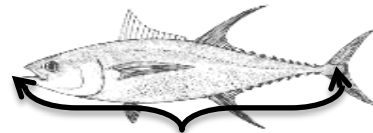
Example of fork length measurement

*Enter time as 1 hr 30 mins or 6:30-8:00 am*