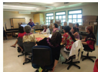
Delta Kappa Gamma breakout session

The women of the Delta Kappa Gamma sorority also welcomed KIRC Staff to their 2008 statewide convention on Maui, where 12 of their number took part in a breakout session on Kaho'olawe.