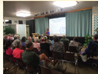
More than 80 seniors enjoyed the Kaunoa presentation