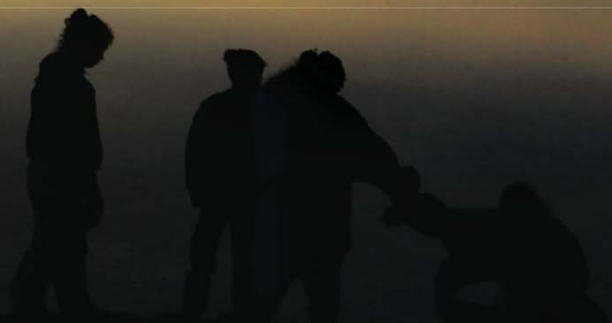
PA group gathers at Maa'ula Nui, Kaho'olawe's highest peak. While the work on Kaho'olawe is meant to rehabilitate the island, many KIRC volunteers insist that it's the island that changes them for the better.

Over the years, important archeological and cultural sites on the island were identified. There are now more than 3,000 identified sites, all of which are part of the National Register of Historic Places. Bombing of the island was temporarily halted in 1990 and in 1992, a healing ceremony, with the aim of further the process of returning the island to the state, was held. That same year, KIRC was created.