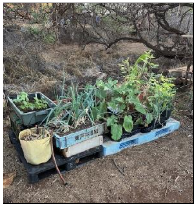
Figure 2. Mala 'Ai

Post Huaka'i Report for Nowemapa 17 – 21, 2021