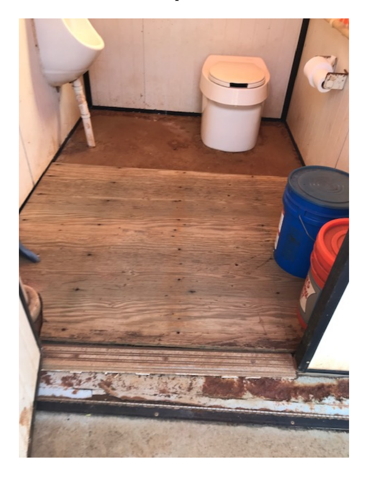
Reinforced floor of lua on Hawai'i Island-side, left

Post Huaka'i Report for September 23 - 26, 2021