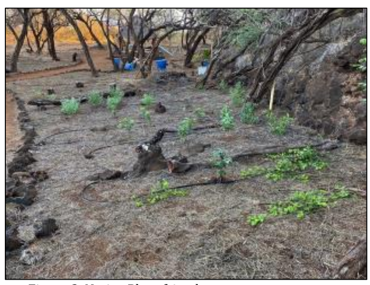
Figure 3. Native Plant friends