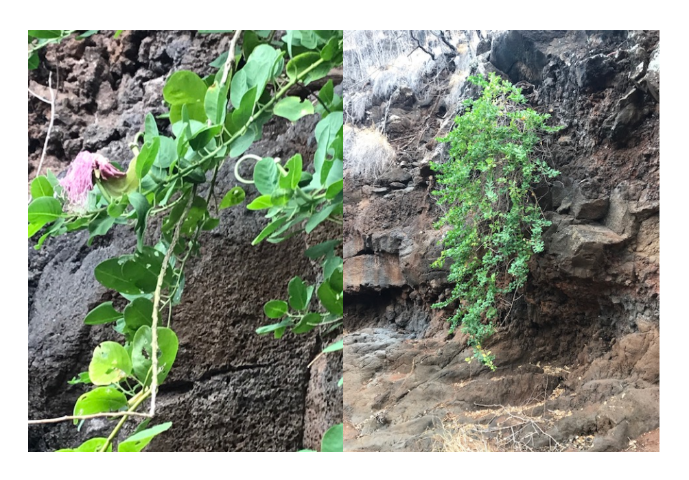
Mai'a Pilo out of a cliff up the Hakioawa streambed

Post Huaka'i Report for September 23 - 26, 2021