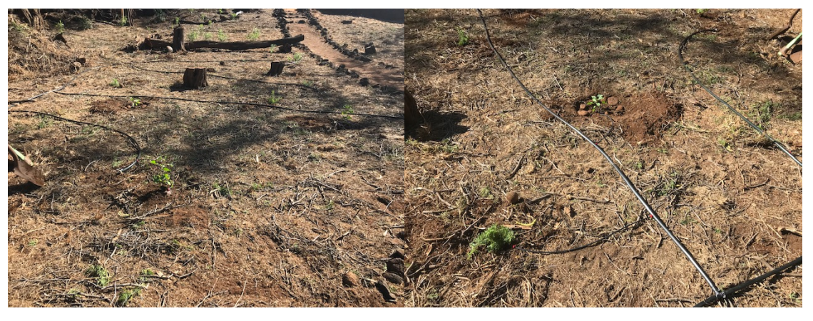
Top Left: laying irrigation line for new plantings Top Right: Completed Solar frame before being painted Bottom Left and Right new plantings with irrigation, makai of Pā Hula