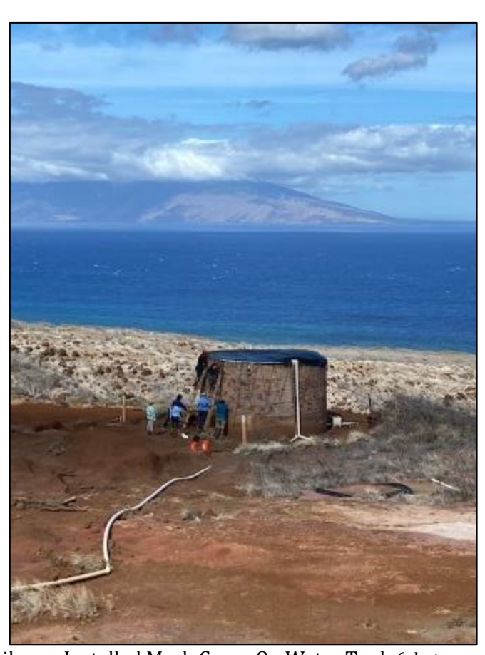
Figure 1. Wailuna - Installed Mesh Cover On Water Tank